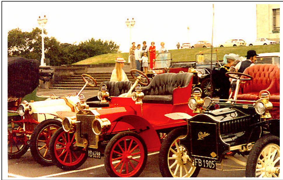
Lined up for the start outside the museum in early 1980s